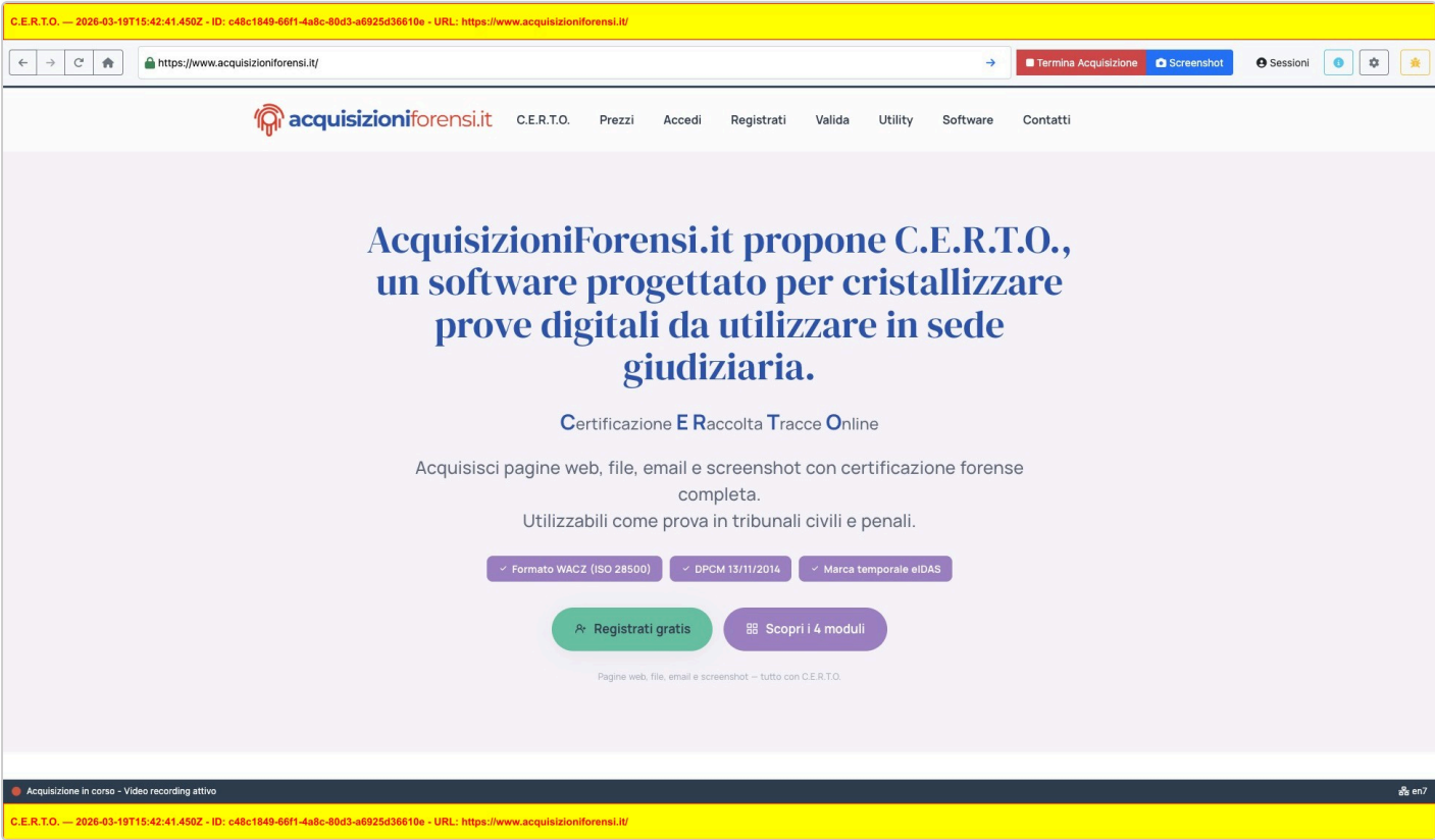
Screenshot 2 — Viewport 205.9 KB • screen_2_2026-03-19_15-42-41-425.jpeg

SHA256: 5740df9cb29cad0426a49069ab59805ffcf24de064e6941f7099684ac34def6